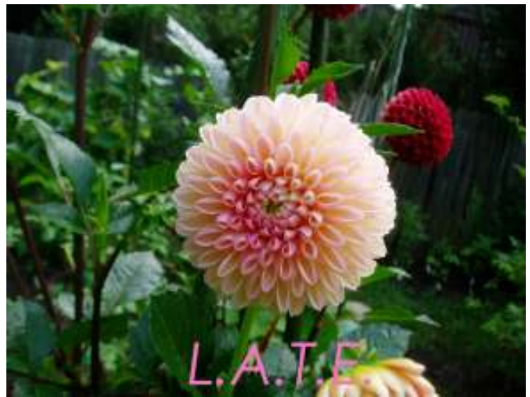
L. A. T. E. M-FD-LB OR/Y