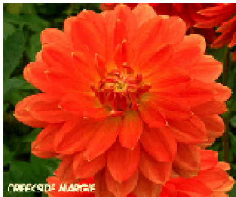
CREEKSIDE MARGE WL- OR