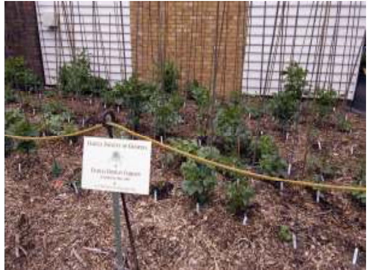
ANOTHER PHOTO OF THE DISPLAY GARDEN WITH THE NEW SIGN

The ADS Board would like to be able to do some other things to assist the local clubs and its dahlia growers. One of the main things is the revamping of the ADS WebPage. Two donors have opted to challenge the entire membership of the ADS to fully fund the new ADS WebPage (which is now being created). Their plan is that they will put up $10,000; the ADS will put up $5,000 (from its rainy day fund). This would occur if the ADS membership would match the $10,000 gift. So, for the next year, the two donors will match all of our monetary gifts to the ADS dollar for dollar up to the $10,000.00 limit. Please talk to your ADS members who might have some discretionary funds to give to the ADS (a 501c IRS charity). Just let Mac Boyer (574-848-4888) or Harry Risetto (202-739-3000) know of your intentions. I know that $3,000 has already been pledged toward our goal of the $10,000!