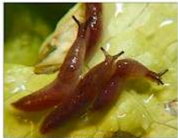
Slugs love lettuce and other tender greens.

SLUGS - They look like snails without shells and they do most of their damage during the night. With several days of rain you will probably find many near the bottoms of your plants and under their leaves. A saucer with a little beer will attract the slugs that crawl in and drown. Leave several short boards around the garden and slugs will crawl under them to spend the day. Turn over the boards and you'll have slugs ready for squashing.