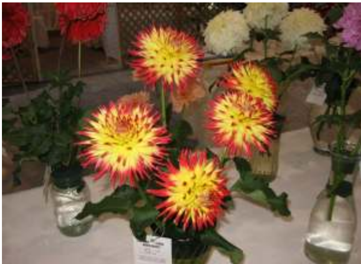
JESSICA BB-C-FLAME, SS FLOWER OF THE YEAR

2008 Dahlia Calendars are now available to order from our vendor or we will have them for sale at the November meeting and Christmas party. The cost will be $12 per calendar plus $1 for the shipping. They are very well done and they make great Christmas presents for your family and friends.