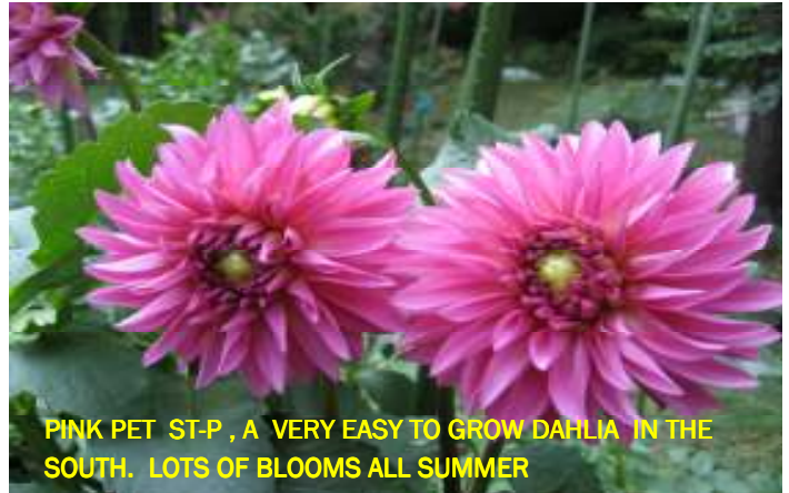
PINK PET ST-P, A VERY EASY TO GROW DAHLIA IN THE SOUTH. LOTS OF BLOOMS ALL SUMMER