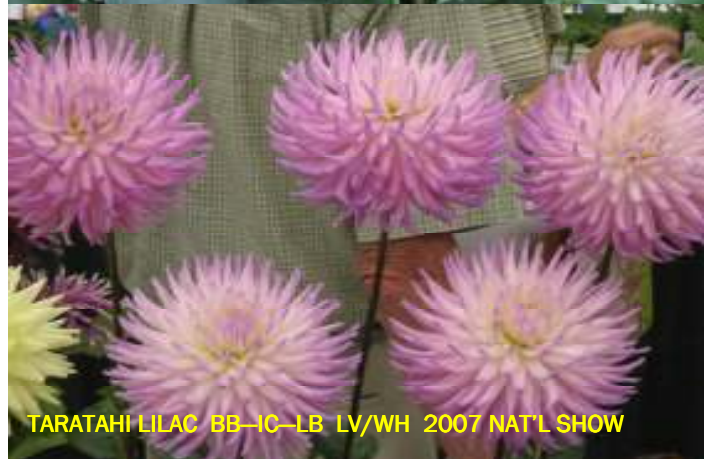
TARATAHI LILAC BB-IC-LB LV/WH 2007 NAT'L SHOW