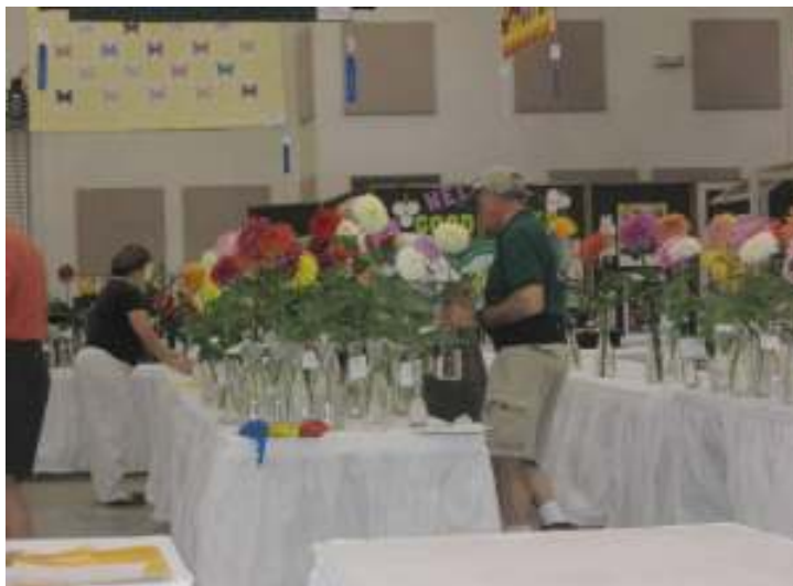
Some of the show tables at the 2007 National Fair Dahlia Show in Perry, GA

Most everyone gathered for dinner on Tuesday evening in Henderson Village South of Perry and enjoyed a wonderful meal. Wednesday morning was staging time and then judging teams were assigned and went to work. There were some very nice blooms despite the growing conditions this season. A catered lunch was provided by the Fair and the (cont P2)