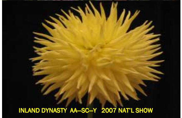
INLAND DYNASTY AA-SC-Y 2007 NAT'L SHOW