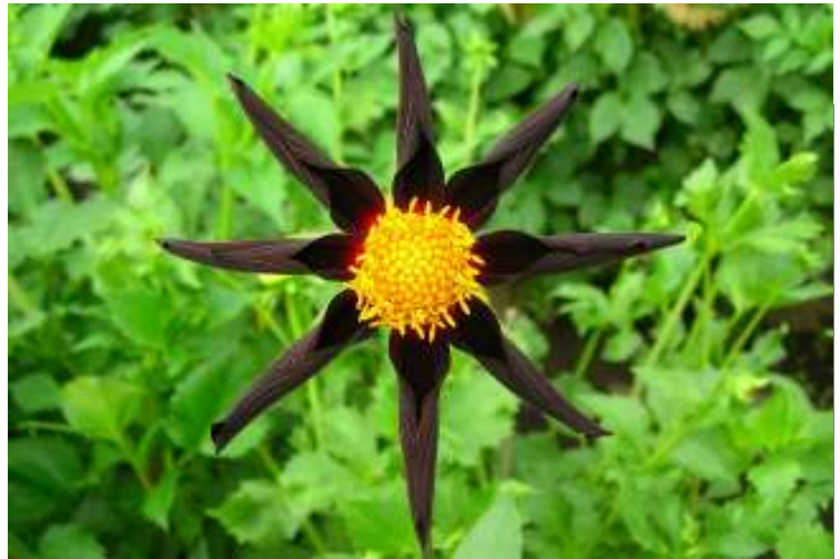
VERRONE'S OBSIDIAN 2011 RELEASE 0-PR

He has identified two new viruses that are commonly found in cultivated and wild growing dahlias.