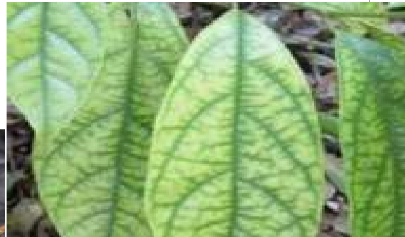
CHLOROSIS— IRON DEFICIENCIES-NOT VIRUS IN THIS CASE, THE VEINS ARE GREEN AND THE REST OF THE LEAF'S SURFACE IS YELLOW.