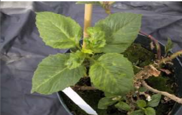
YELLOW VEINS WITH SPOTS