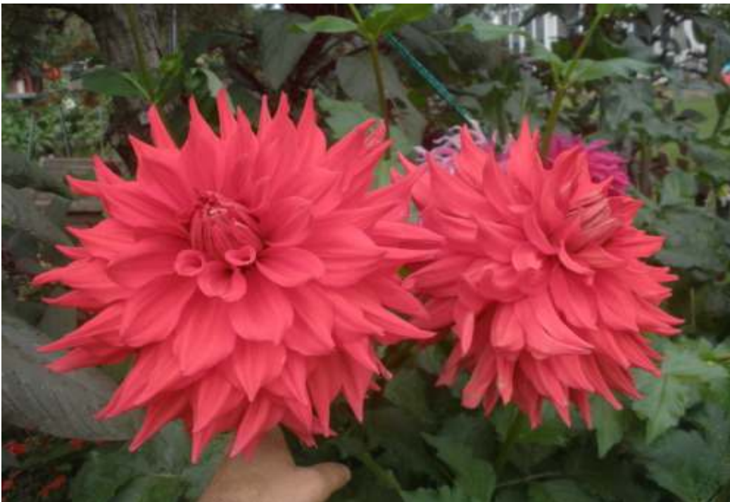
TOTENKO AA-SC-RD LIKES THE HEAT

Inches high with no protection from the brutal sun. Some are blooming already after planting in middle to late May. My tuber plantings haven't been as good as some have rotted and it is usually from the quality of stock and not the growing conditions. Brian K has always said you need to plan on a 30% replacement rate. That's expensive but true. CONT ON P-2