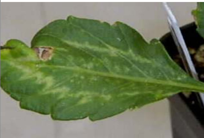
DAHLIA LEAF WITH “OAK LEAF” PATTERN. ALSO KNOWN AS MOSAIC VIRUS.