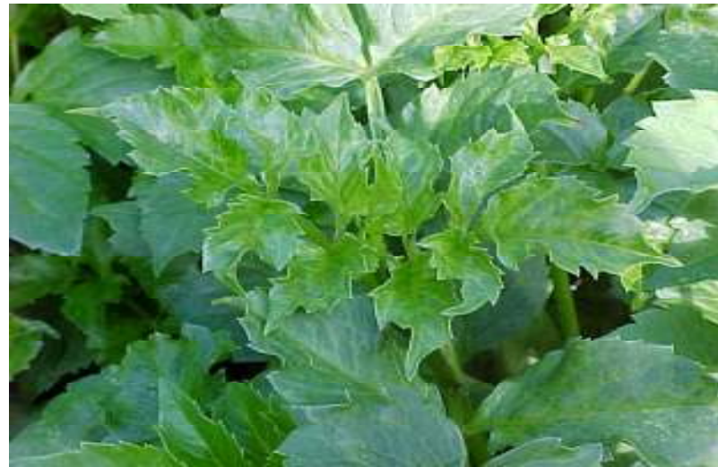
CRINKLED & MISHAPED LEAVES. MANY TIMES, THESE FEATURES ARE COMBINED WITH STUNTED GROWTH. IN THOSE CASES, THE DISTANCE BETWEEN LEAVES IS MINIMAL