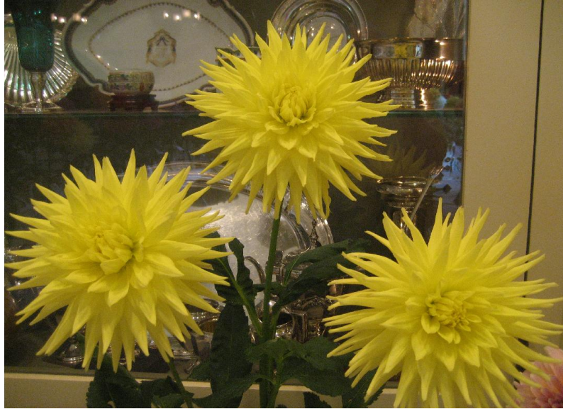
INLAND DYNASTY AA-SC-Y WINNER IN THE GEORGIA SHOW